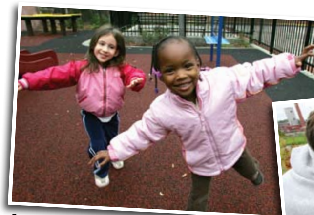
Paterson Family Center students at play

In these challenging economic times, it is important to note that 90 cents of every dollar donated to NJCDC goes directly to our programs. We pride ourselves on providing services efficiently through programs that build self reliance, not dependency.