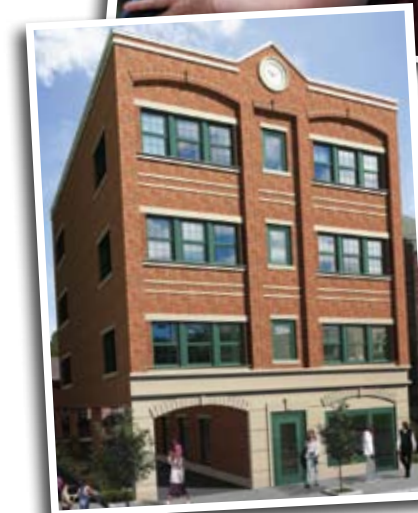
Future Spruce Terrace Apartments