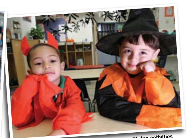
Our after-school programs balance education with fun activities