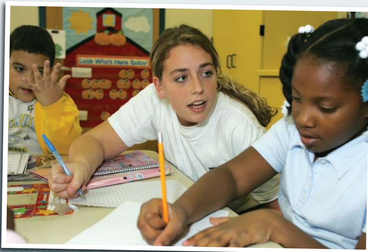
Our AmeriCorps members serve in a number of neighborhood schools as part of our "Community Schools" educational initiative.

meaning they come from some of the poorest families in the state. This economic indicator, combined with unacceptable drop-out rates in area high schools, demonstrates the reason NJCDC is so committed to providing exceptional educational opportunities.