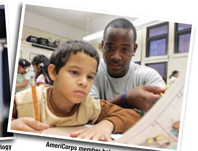
AmeriCorps member helps a student at school