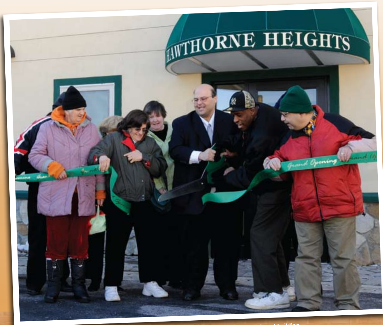
New Hawthorne Heights residents celebrate the grand opening of their new 12-unit apartment building

provide opportunities to transform individual lives, but serve as catalysts to help rebuild neighborhoods.