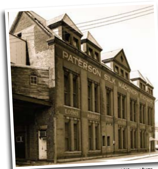
Historic building constructed during the 19th century

One example of neighborhood revitalization is the creation of our Independence House transitional living facility for homeless youth. This project adaptively reused and restored the former Rogers Locomotive Works Administration Building, originally constructed in 1881, into a home for ten young men in need of safe, decent, and affordable housing. Independence House offers each of the residents his own room as well as common areas including a kitchen, recreation area, and a laundry room.