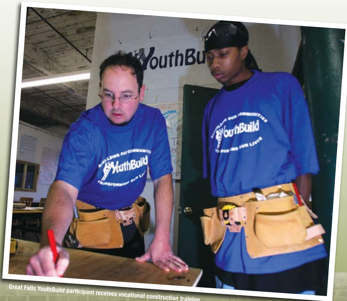
Great Falls YouthBuild participant receives vocational construction training

nect with young people before school, during school, after school, on weekends and during the summer. Our programs offer a comprehensive approach to help youth obtain the skills necessary for living successful and productive lives—and to become the future leaders of their community.