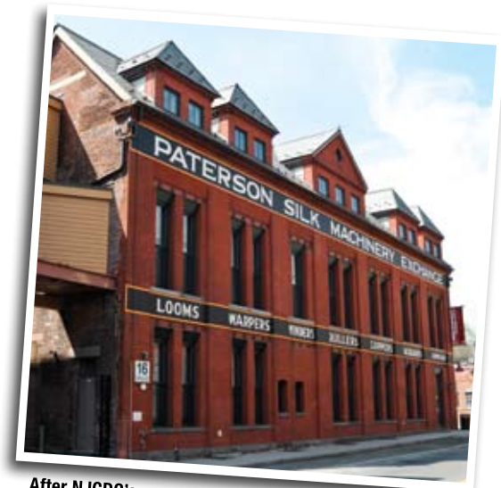
After NJCDC's renovation in 2003