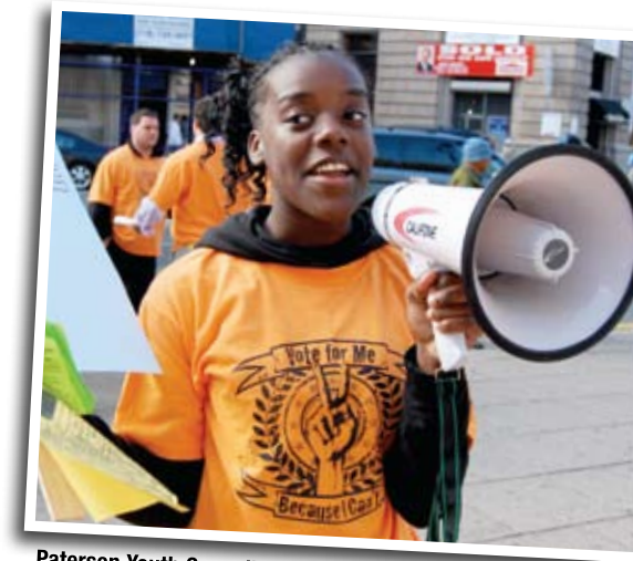
Paterson Youth Council member urges citizens to vote