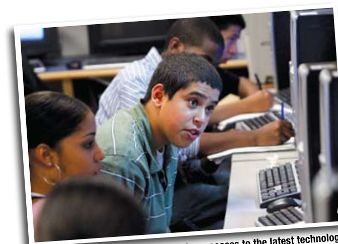
Garrett Morgan Academy students have access to the latest technology