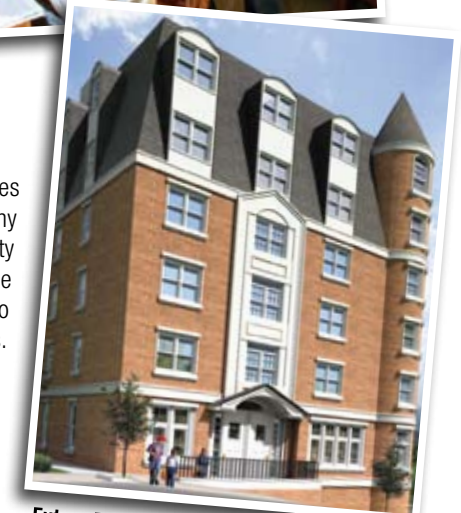
Future Elm Street Apartments