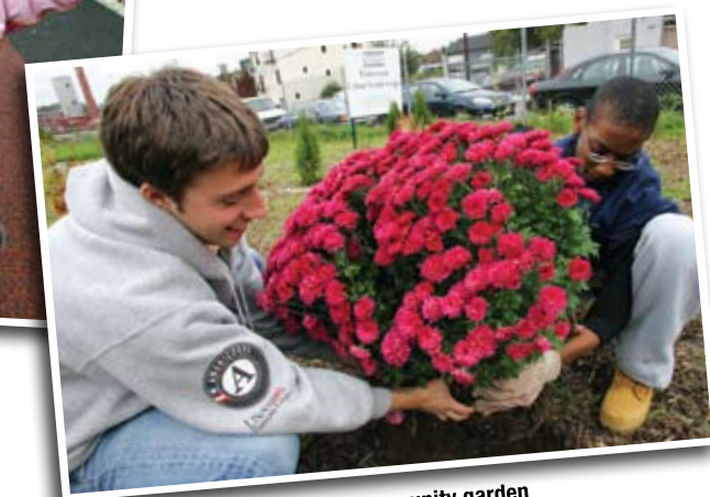
NJCDC volunteers creating a community garden